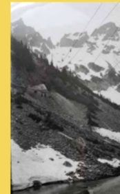
These are the former Pride of the Mountains mine tram structures across valley from trail to Glacier Basin.