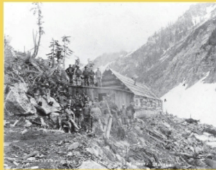
Bunk house and cook house for the mines in Glacier Basin - trail passes right through this area...and you can match the boulders in the picture with present day view