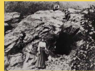
The outlet end of the tunnel under the rock mass mentioned

The powerhouse was later used by the Rainy mine to provide power to a compressed air device to dewater the mine shaft, but was destroyed by fire on August 28, 1913, and never used again. Remnants are below and to the left