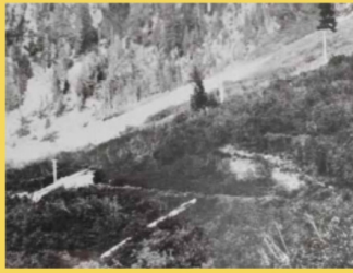
Justice/Golden Cord powerhouse as seen from the area of the Rainy mine.