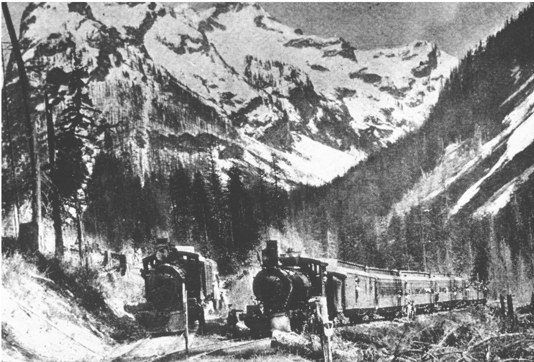
Excursion train to right with open cars on the back and second train at the switchback below Monte Cristo, dated 1902. The train on the right probably is backing down to the point of the switchback, both trains westbound.