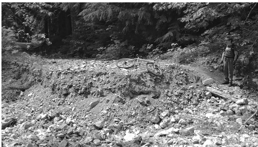
Washout at Sylvan Creek, Monte Cristo Road (past Hap's Hill)

Tourism in the townsite has been constant, with easily 50+ persons seen hiking to the townsite on a given Saturday. The roadway beyond Twin Bridges has remained largely unchanged, with the exception of a recurring washout at Sylvan Creek (just beyond Hap's Hill) which incurred significant damage over the winter. The road is still passable on bike and foot but would likely be a challenge for a typical 4-wheel drive vehicle. Hikers have also been flocking to other trails along the Mountain Loop highway, especially Lake 22, where the parking lots routinely spill out on to the highway, resulting easily in 200 cars